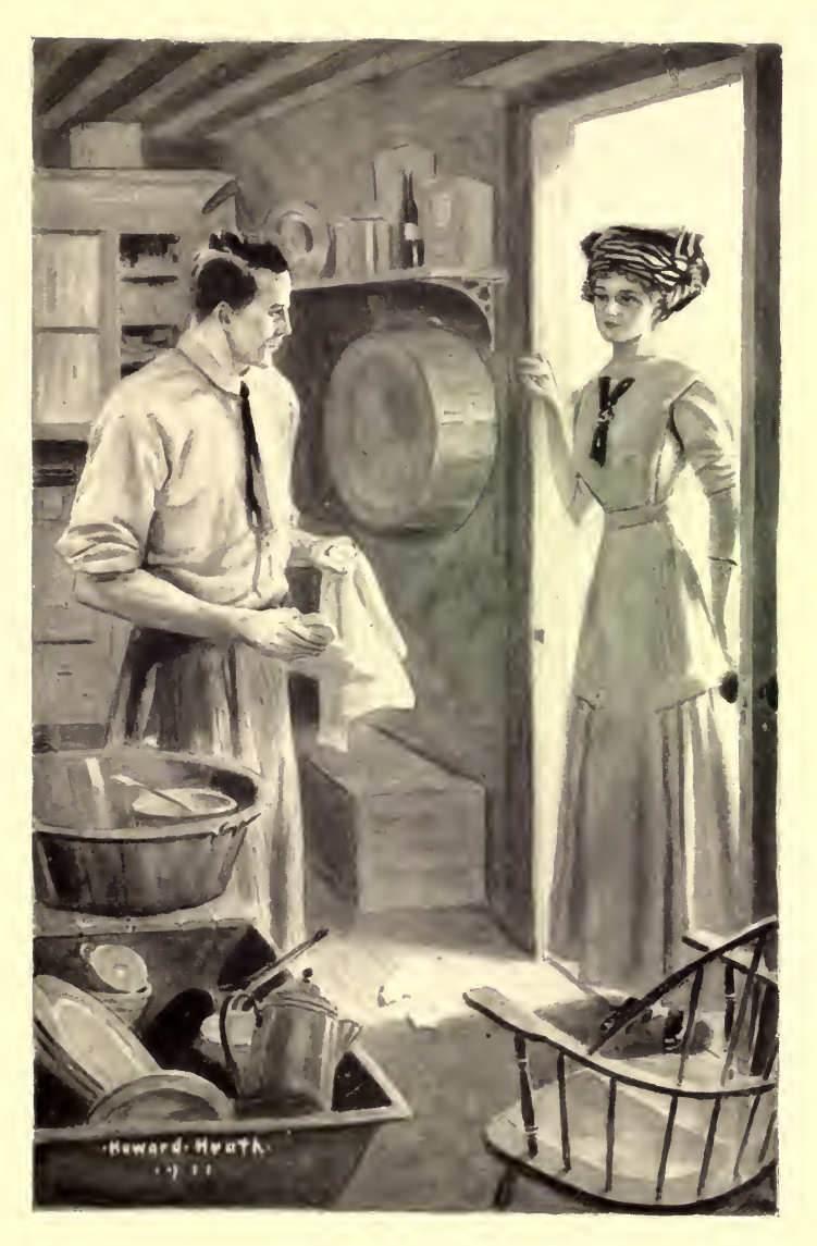
"'Don't mind me, please,' she said."